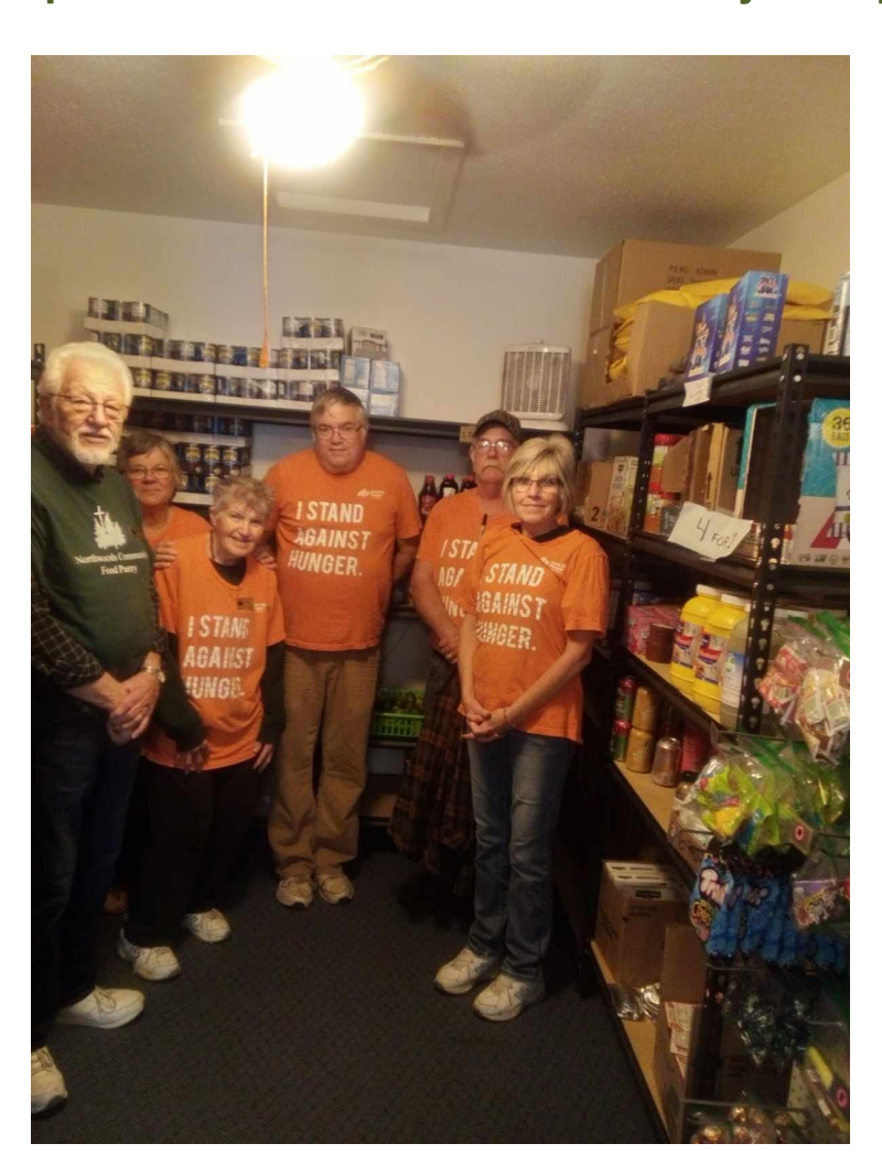
PARTNER CELEBRATION Northwoods Community Food Shelf

Northwoods Community Food Shelf of Hayward, WI, celebrated Hunger Action Month by wearing orange! Thank you, Northwoods, for working so diligently to serve your neighbors. We recognize and acknowledge your dedication, passion, and hard work.