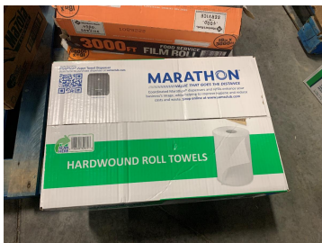
Marathon Hardwound Roll Paper Towels

Quantity - 1 Case Size - 6 rolls, 700ft each