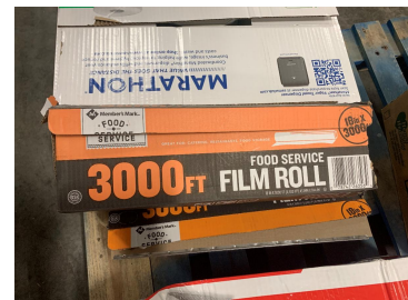
Marathon Film Roll (2)

Quantity - 1 case Size - 16 Packs of 250 towels