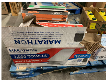
Marathon Multifold Paper Towels

Quantity - 1 Case Size - 6 rolls, 700ft each